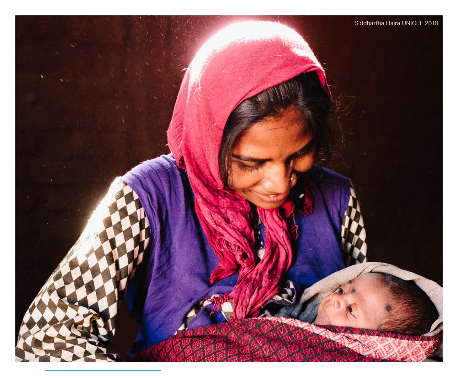
117 Fischer, 2019

The risk factors that lead to harmful child protection outcomes often go beyond sectoral boundaries. Therefore, prevention programs must be multi-faceted and multi-sectoral if they are to succeed. Understanding the protective factors required to prevent harm to children will help to inform integrated, multi-sectoral program approaches. Equally important is the need to share efforts to protect children with development actors. It is through cohesive partnerships with development actors that existing capacities and systems can be strengthened to more effectively prevent harm to children in humanitarian settings.<sup>117</sup>